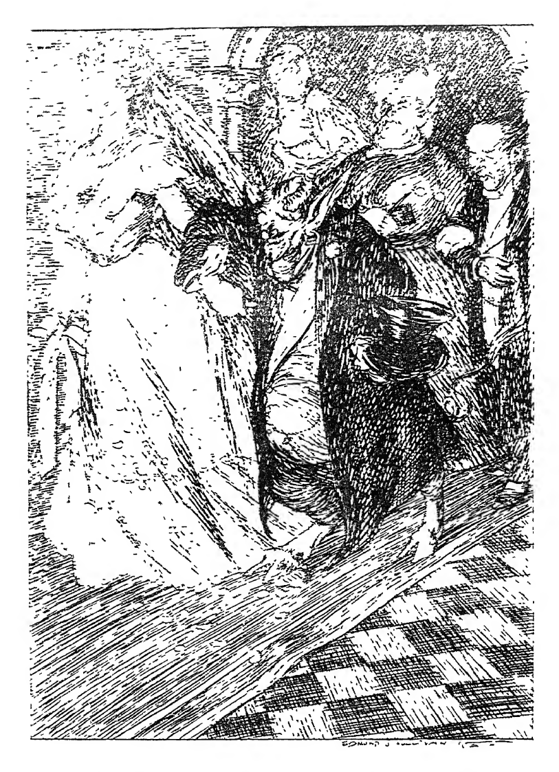
* THE FEAR THAT OFTEN FURNS A WOMAN FROM A BEAUTIFUL TO A MERCENARY MARRIAGE WILL VANISH FROM LIFE' (see p. 189). To face page 100.